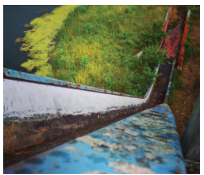
Dogpatch, USA, a closed amusement park near Marble Falls, Ark., is explored in many photos on abandonedarkansas.com Giant slide ruins.