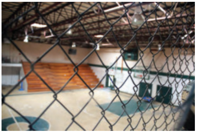
Winslow Public Schools were consolidated with Greenland, Ark., schools in 2004. The high school gym still looks as if it awaits a basketball game between the two rivals.