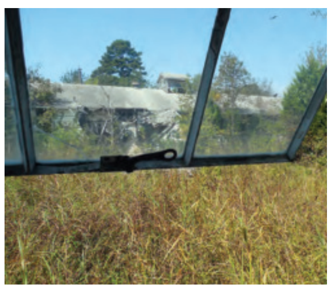
Part of Fort Chaffee Hospital complex still standing. Some of the buildings have burned.