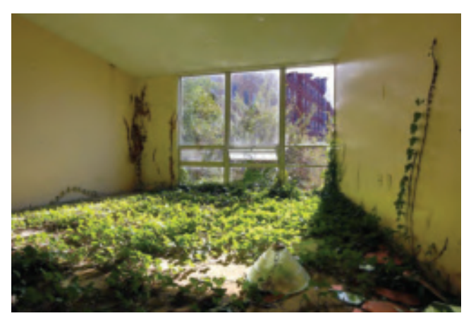
The Majestic Hotel, Hot Springs, Ark., a storied landmark at the corner of Park and Central avenues, burned in 2014 and was razed this year. Abandoned Arkansas photographed nature checking into a guest room.