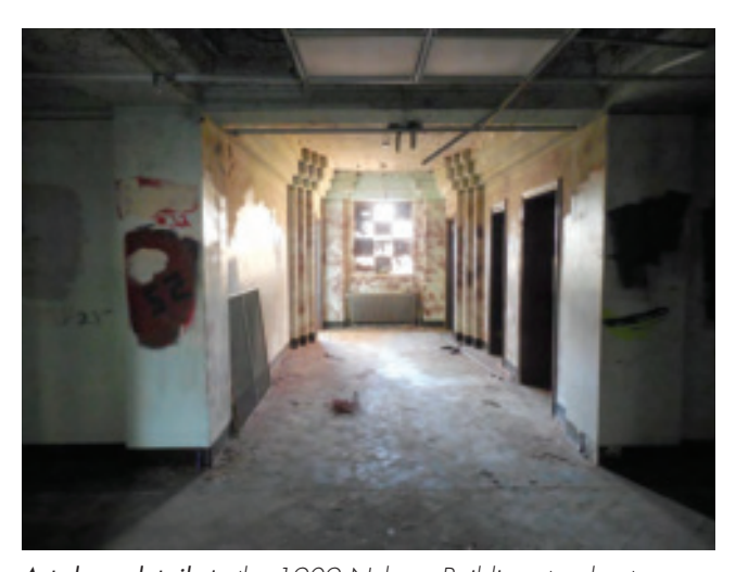
Art deco details in the 1909 Nyberg Building stand out even in its empty condition.